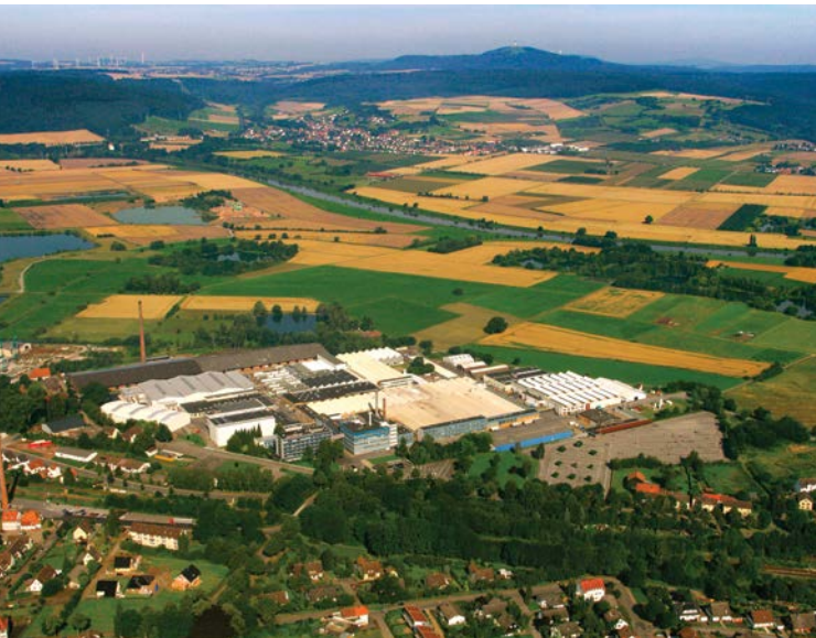
Stiebel Eltron factory in Holzminden, Germany

Stiebel Eltron's factories in Germany are in Holzminden and Eschwege. The company has additional factories in Slovakia, Thailand and China.