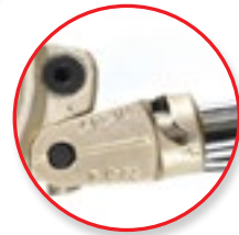
Easy 90° to 180° Switch! No Crossing of Handles!