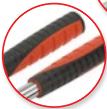
Ergonomic Cushioned Grips, Comfortable Use!

60% Less Force Required vs. Traditional Benders