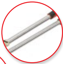
Extra Long Handles, More Leverage, Reduced Force!