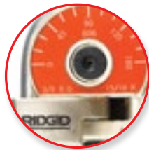
Clearly Visible Degree Marks for Accurate Bending