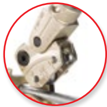
Roller Dies Reduce Force and Tube Flattening